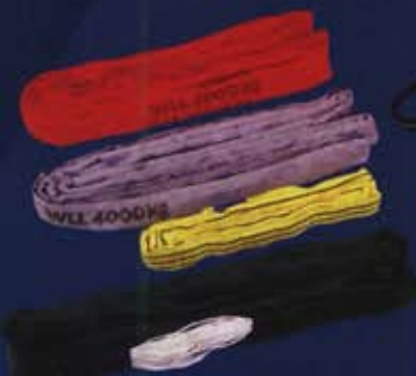
Poly Round Slings

Slingmax Fiber Slings have a rated capacity of 50 tons. They require less effort to rig, are easiest to transport and store, and cost less to use.