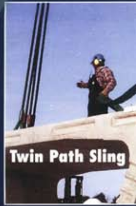
Twin Path Sling